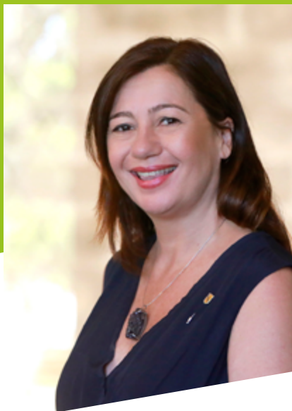
President of the Government of the Balearic Islands