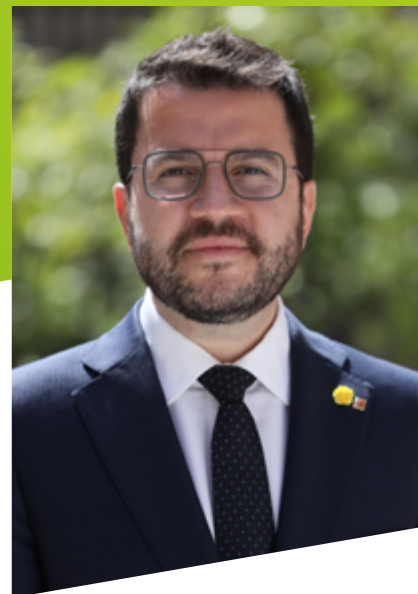
President of the Generalitat of Catalonia