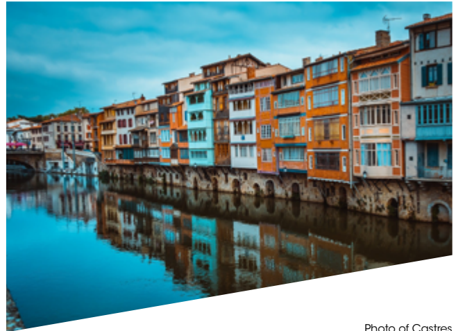
Photo of Castres

4.2 By positioning itself as a key player on all the major European and Mediterranean strategic networks.