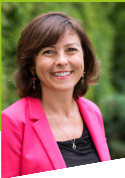
President of the Euroregion

President of the Region of Occitanie / Pyrenees-Mediterranean